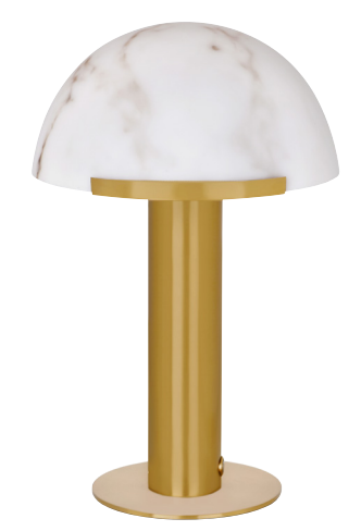
CORDLESS LED TABLE LAMP Item Code: 1000210

Colour: Brass with Faux Alabaster Shade Barcode: 9313996110143